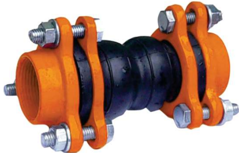
FORGED STEEL FLOATING ENDS POWDER COATED