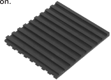
Ribbed Mounting Pads