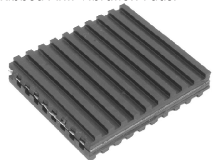
Metal Sandwich Pads